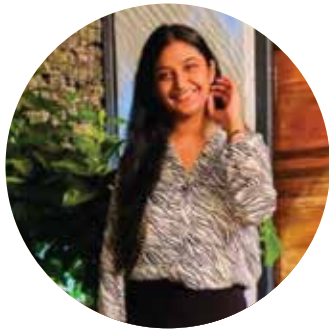
Haifa Khan Symbiosis College